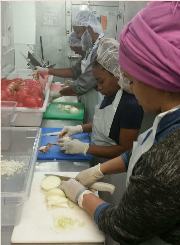
DYRS Youth Council volunteering at DC Central Kitchen on January 12