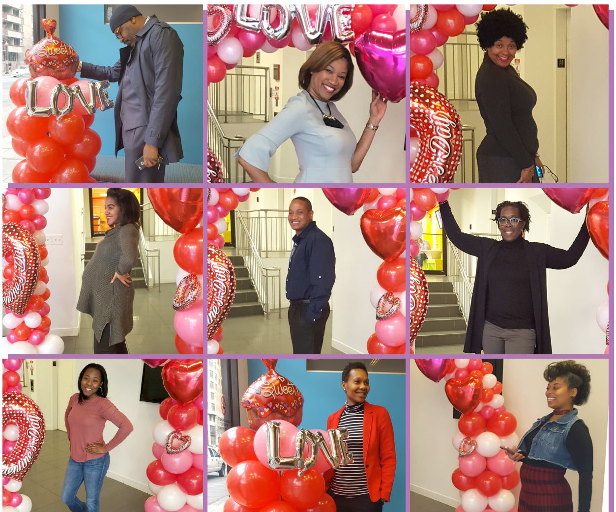
DYRS employees found themselves greeted with Valentine's Day decorations as they entered the building on February 14, promoting that loving feeling!